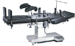
Electric Operating Table