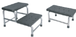
Foot Steps Double, Single