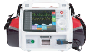
Rescue Life 9 Defibrillator Progetti Italy