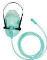
Oxygen Mask (Adult, Child, Infant)