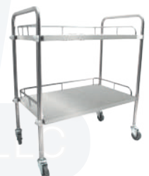
Stainless Steel Trolley 2 Shelves