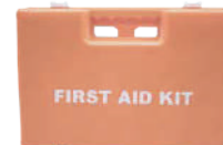
First Aid Kit Orange