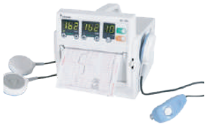
Antepartum Fetal Monitor BT-300