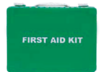
First Aid Kit Green