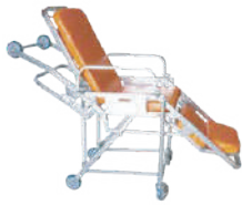
Chair Ambulance Stretcher Orange