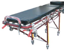
Automatic Loading Stretcher