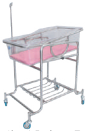
Medical Infant Bed