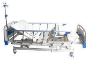
Electric 3-Function Hospital Bed with Mattress