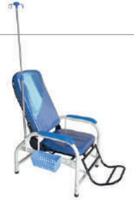
Blood Collection Chair Bed