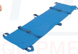
Carry Bag Soft Stretcher