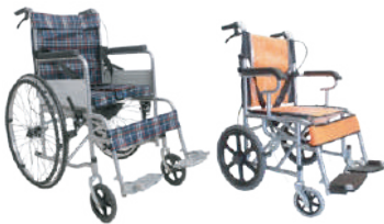
Wheel Chair Wheel Chair, Children