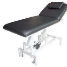
Electric Examination Couch