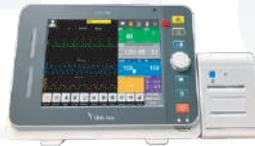
Patient Monitor with Printer BT-740 / BT-770