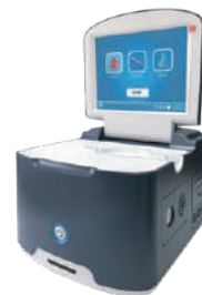
Blood Gas Analyzer