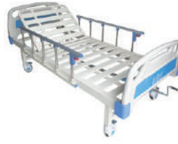
Manual 1-Function Hospital Bed with Mattress