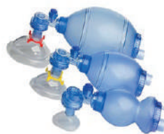
Manual Resuscitator PVC Ambu Bag (Adult, Child, Infant)