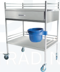
Stainless Steel Trolley 1-Drawer