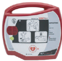
Rescue Sam AED Progetti Italy