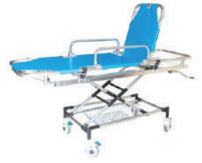
Rescue Stretcher Bed