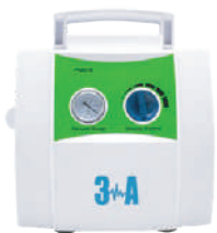
Portable Suction Machine PMS-B