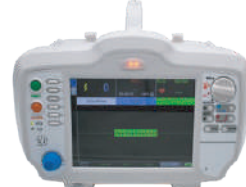
Defibrillator Monitor DM12