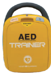
AED Trainer 501 HR-501T