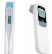
Digital & Infrared Thermometer