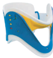
Cervical Collars Adult & Child