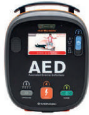
AED 701 Defibrillator HR-701