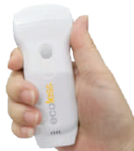
Wireless Ultrasound Probe 3 in 1