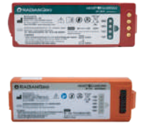
AED 501 Battery AED 701 Battery BT-303, BT-701