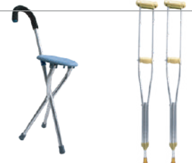
Crutch with Seat, Crutches (L,M,S)