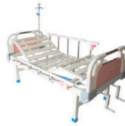
Pediatric Medical Bed with Mattress