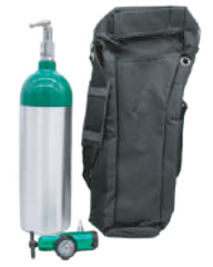
Portable Aluminium Oxygen Cylinder with Bag