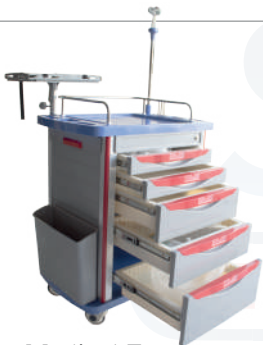
Medical Emergency Trolley