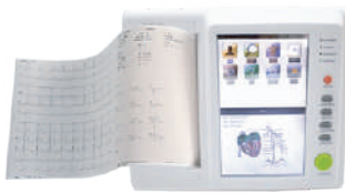
12-Channels ECG Machine E12