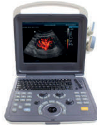
Ultrasound Machine Colored