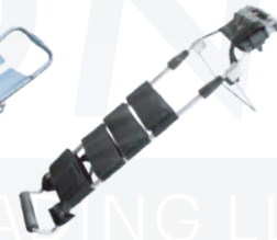
Traction Splint Adult & Child