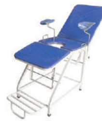
Gynecological Examination Bed