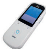
Handheld Pulse Oximeter