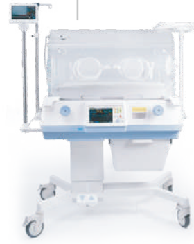
Infant Incubator BT-500