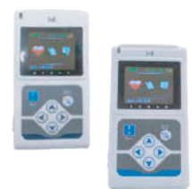
HLT05/HLT07 Dynamic Portable ECG System