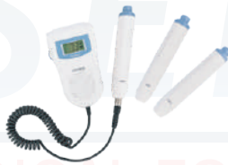
Vascular Doppler, HI-dop BT-200