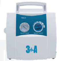
Portable Suction Machine PMS-A