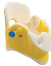
Cervical Collar Yellow