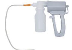
Manual Suction Device