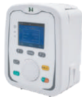
Infusion Pump IPO2