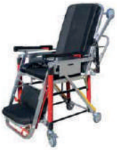
Chair Ambulance Stretcher Black