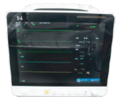
Multi-parameter Patient Monitor MPP_