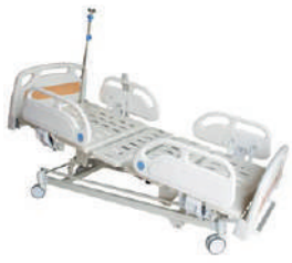
Electric 5-Function Hospital Bed with Mattress