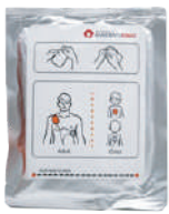
AED Pad P303