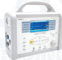
PEV-08 Respiratory Ventilator