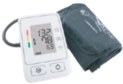
Blood Pressure Monitor