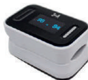
Fingertip Pulse Oximeter