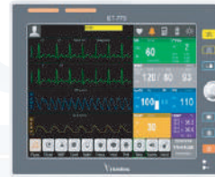
Patient Monitor BT-770