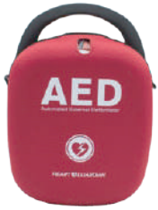
AED 501 Defibrillator HR-501