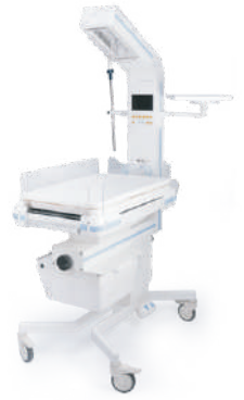
Infant Warmer BT-550