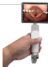
Video Laryngoscope Ecoless Italy