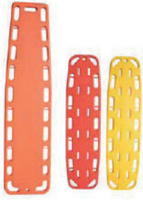
Spinal Board (Long & Short)