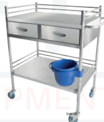
Stainless Steel Trolley 2-Drawers