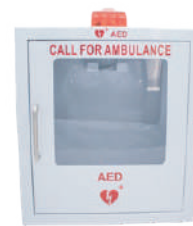
AED Wall Cabinet