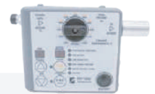
Portable Lung Ventilator FM FEV1002