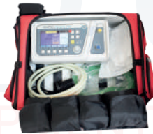
Shangrila 510s Portable