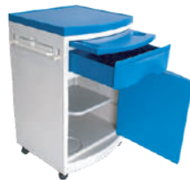
Medical Bedside Cabinet