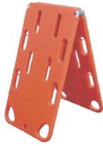
Foldable Spinal Board Short