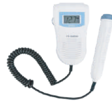
LCD Fetal Doppler BT-200