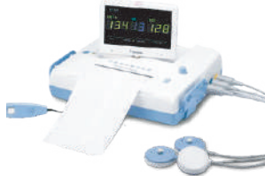
Fetal Monitor BT-350