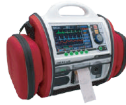
Rescue Life 7 Defibrillator Progetti Italy