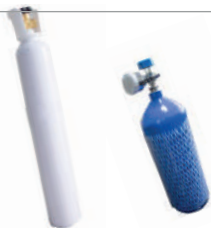
Oxygen Cylinder (10L, 2L)