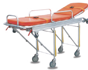
Automatic Loading Stretcher