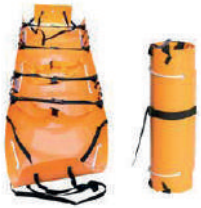
Multi-function Roll Stretcher